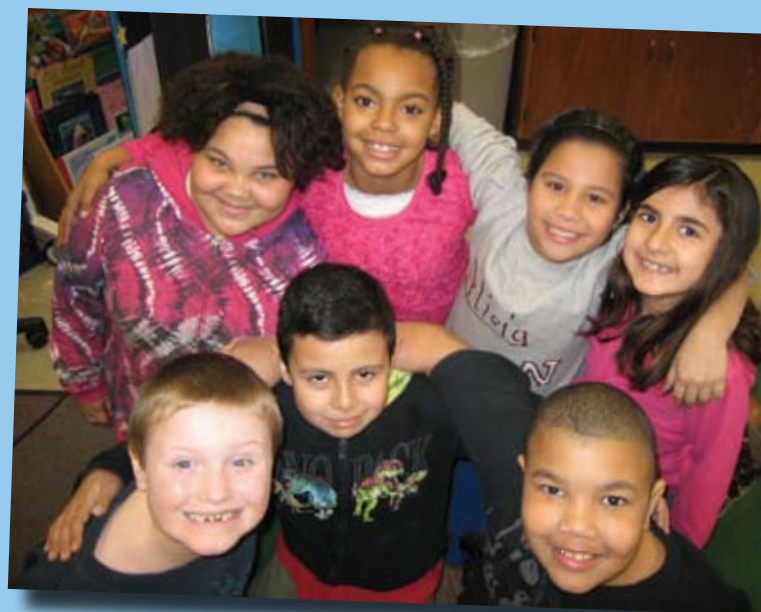
Students at Elliott Elementary School love their Impact Reading Center volunteers!