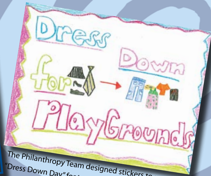
The Philanthropy Team designed stickers to promote "Dress Down Day" for teachers & staff at their schools.

the tables at the Black History Celebration. The team went into Middle and High Schools and made presentations to the staff to hold "Dress Down Days" , for which school staff members would donate money in exchange for dressing casual and wear a sticker promoting ILA's cause on a specified day.