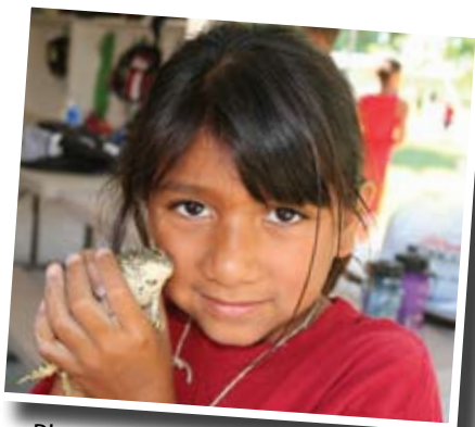
Please help all these great kids go to camp!

Over $15,000 in Camp Sponsorships is needed! Play a part of making lifelong memories! $250 or $140 to sponsor one youth.