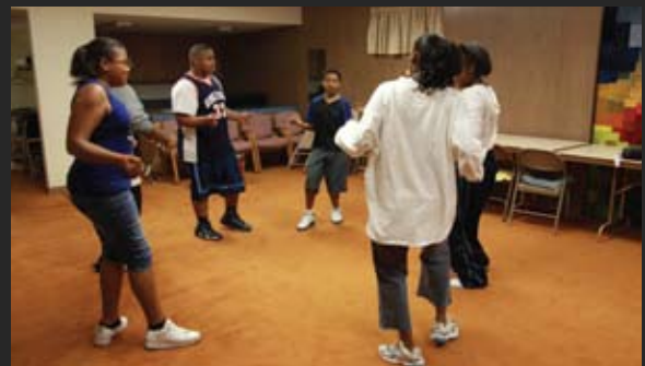
Wearing a linen ephod, David was dancing before the LORD with all his might ... - 2 Samuel 6:14