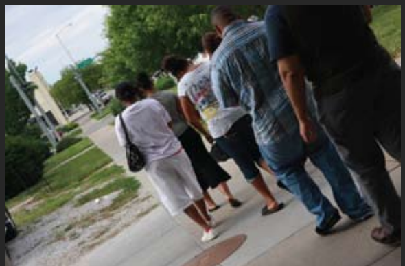
The Dance Team stepping out in faith as they take their dancing to the streets.