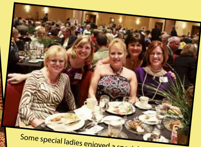
Some special ladies enjoyed a special evening.