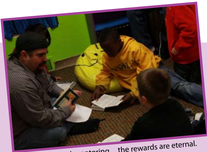
Teaching and mentoring ... the rewards are eternal.

People who serve in our faith programs often receive much more than they give with their investments of time and talent. See Join In on page 7 to make an impact!