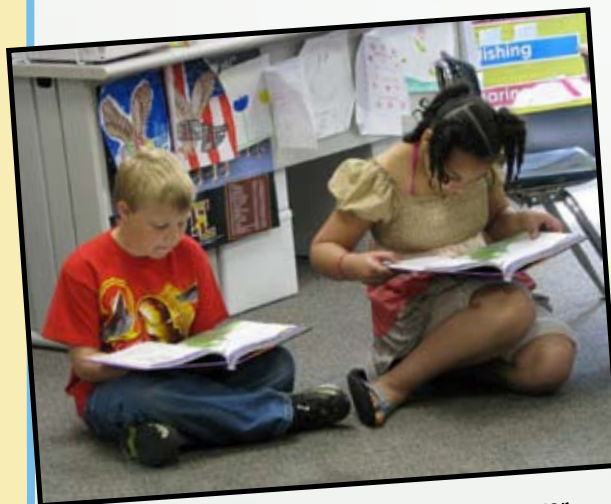
The Impact Reading Center helps empower struggling readers with the gift of lifetime literacy.

As I prepared to leave Elliott Elementary that afternoon, I was touched by the sight of adults taking time out of their busy days to serve in Lincoln's urban neighborhoods. It was not what I first thought. It was not obvious that something so powerful was taking place. I'm glad my eyes were opened.