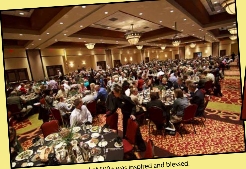
A crowd of 500+ was inspired and blessed.