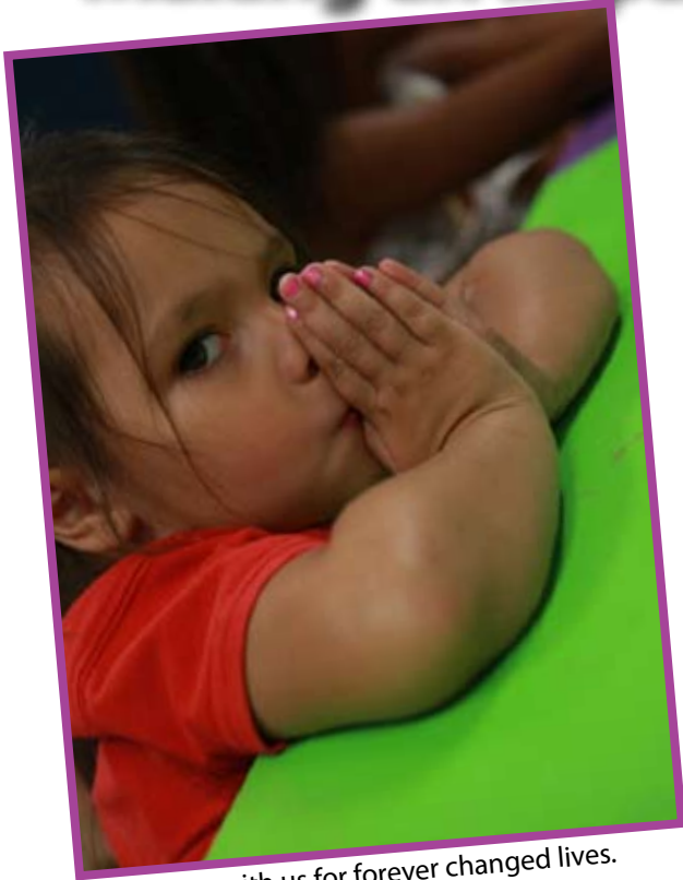
Pray with us for forever changed lives.

Surround yourself with positive people. Good advice.