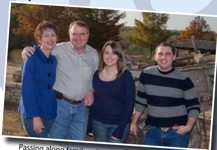
Passing along family values is a lifelong process that impacts generations.

"But you shall remember the LORD your God, for it is He who is giving you power to make wealth that He may confirm His covenant which He swore to your fathers, as it is this day." - Deuteronomy 8:18